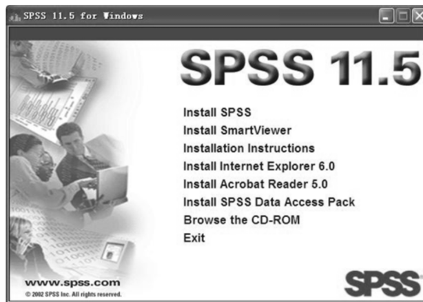
Fig. 1. SPSS statistical software interface

The SPSS statistical analysis software mentioned above has a higher frequency of application in theoretical research. Zhou has believed that the basic functions of statistical analysis software include data management, statistical analysis, chart analysis and output management [10]. Figure 1 shows the interface of the SPSS statistical software.